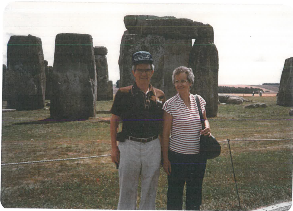
Stone Henge, England