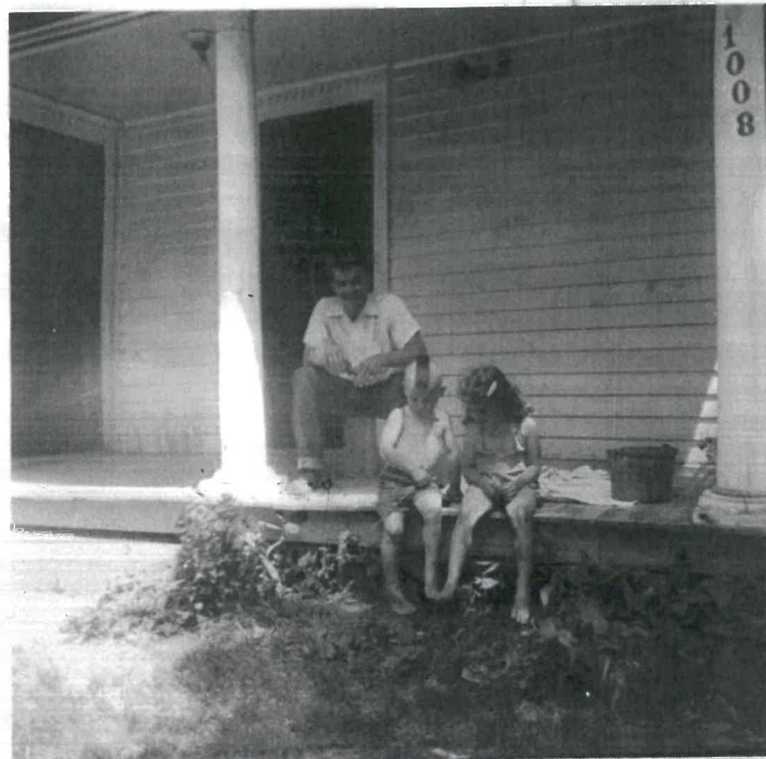
1008 Cedar St. Atlantic. La