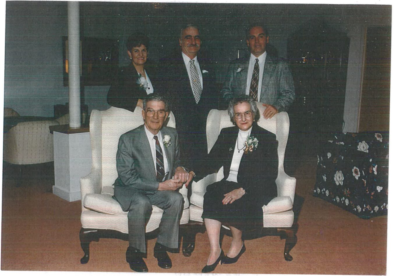
50 th wedding anniversary